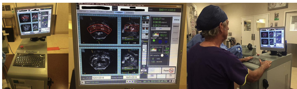
Fig. 2. Sonablate-500® (Sonacare Medical©, Charlotte, North Carolina, USA) user interface system.